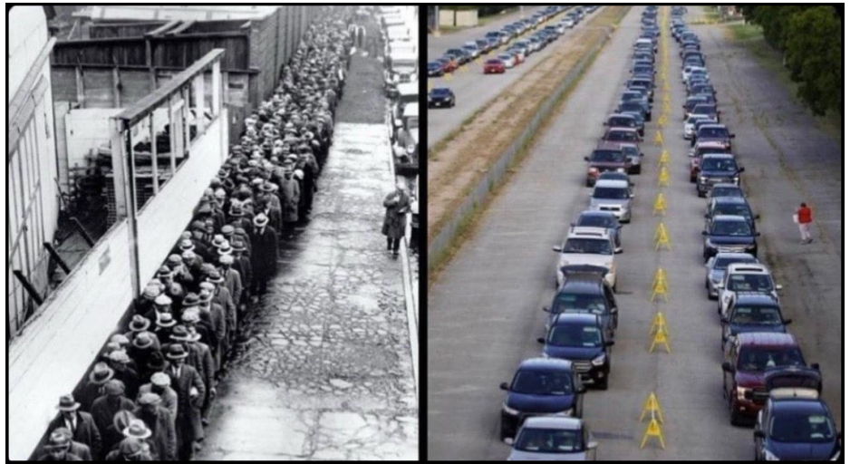
Food Bank line in the 1930s, left, and Food Bank line today in Texas.

We care for ourselves, each other and our church to the best of our ability in keeping us all safe, healthy and strong. I wish