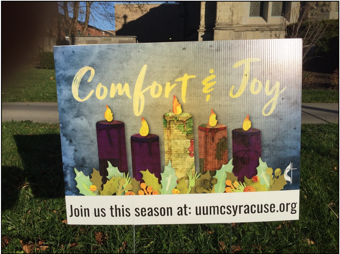
One of many signs outside the church inviting the public to find and join us online.