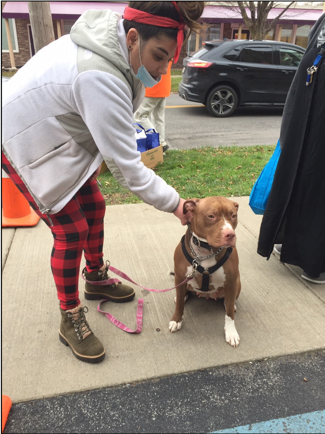
Dogs sometimes accompany their owners for our Emergency Food Distribution