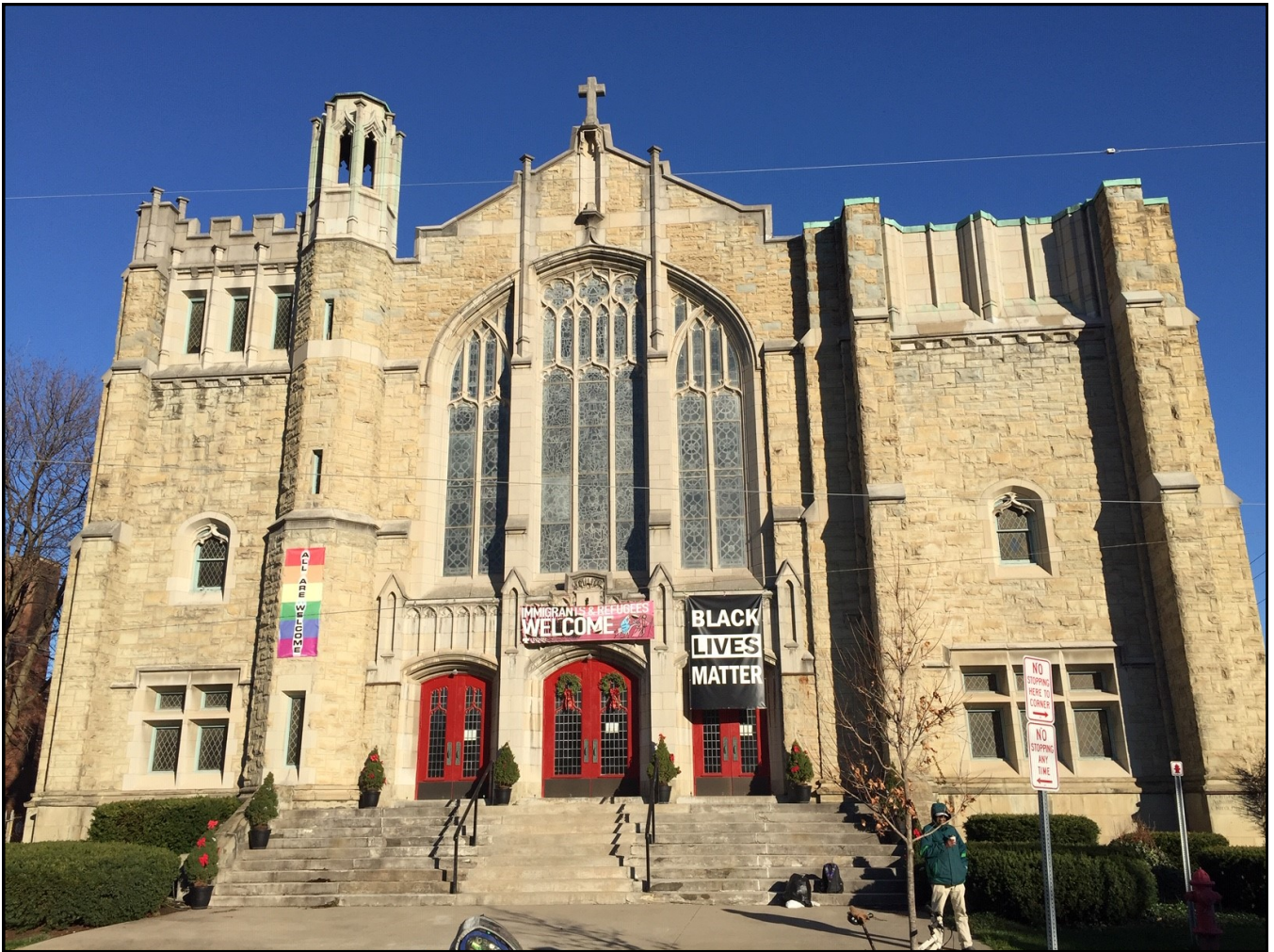
UUMC on a bright, sunny morning with Christmas trees in the planters on the front steps.