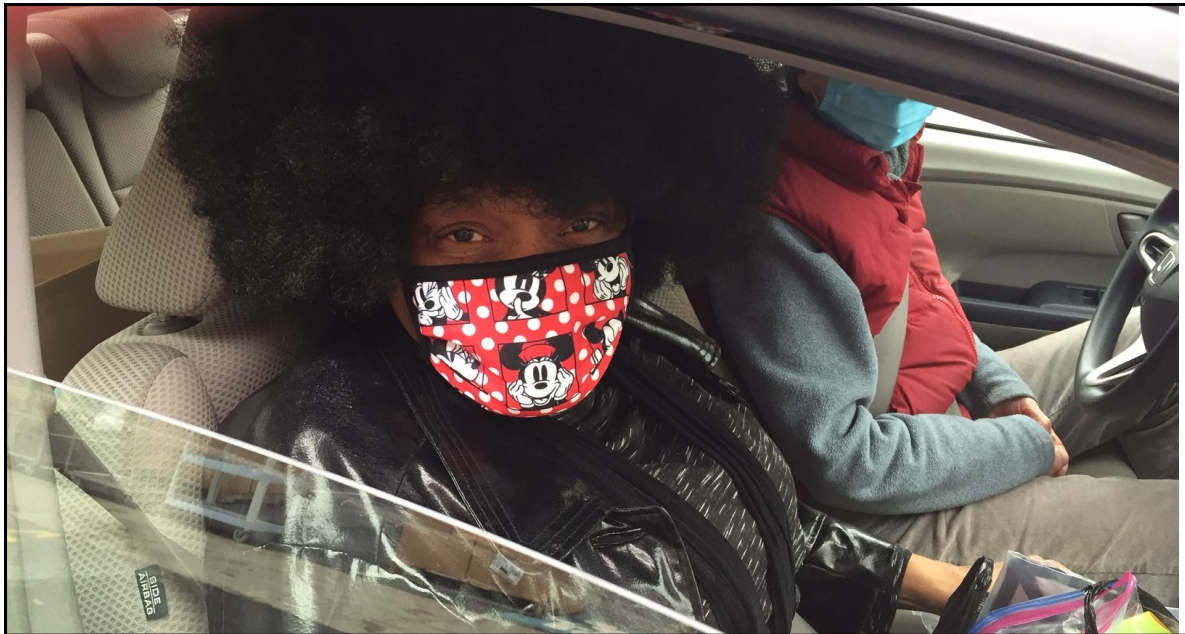
Mickey and Minnie Mouse facemasks were given out by our Food Center.