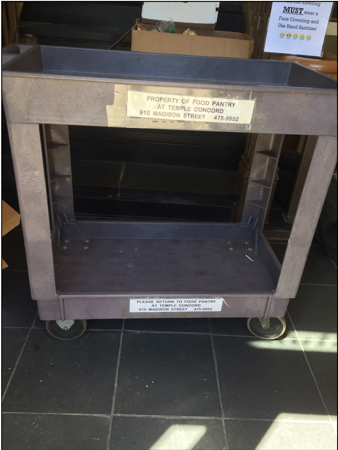
A cart from Temple Society of Concord, received after they became a part of The Food Center @ 324 University Ave.