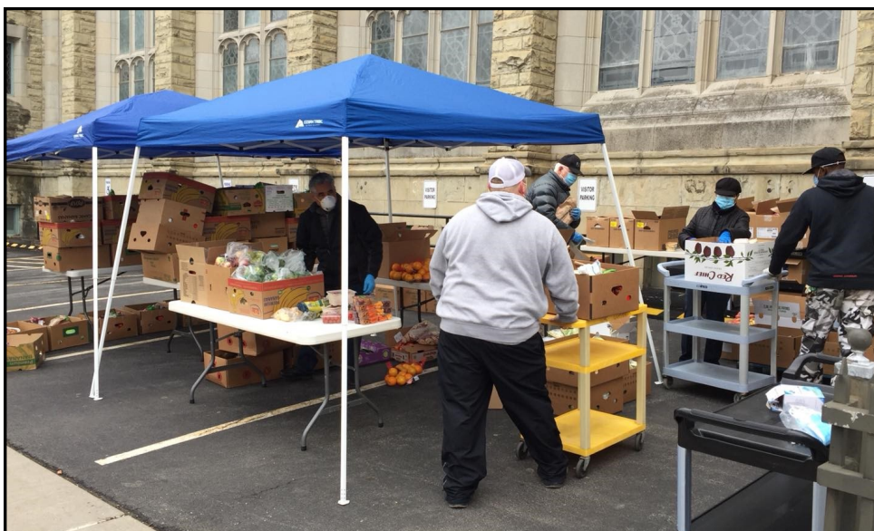
UUMC staff and volunteers work the outdoors Food Pantry on March 27.