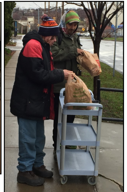
Guests pick up a bagel and coffee breakfast to go March 29.