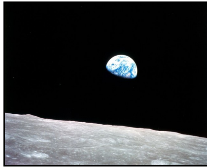
A photo of Earthrise taken by the astronauts on Apollo 8 as they orbited the moon.

I've been watching the Netflix show The Crown . It is a show based on the lives of Queen Elizabeth and her family. The latest episode I watched featured the family watching the astronauts and Apollo mis-