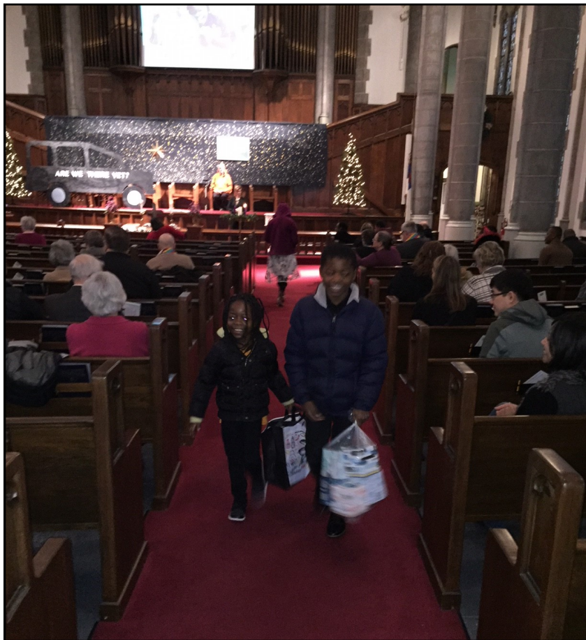
Children collect toiletries donated by members for Food Pantry guests.