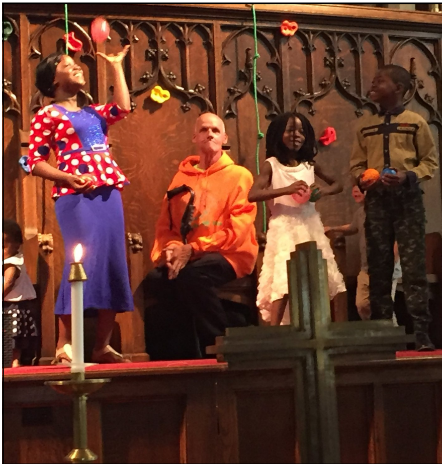
Sept. 22, the children tried juggling, in connection with Jesus' parable about not being able to serve two masters. It's like trying to juggle — your attention is divided.