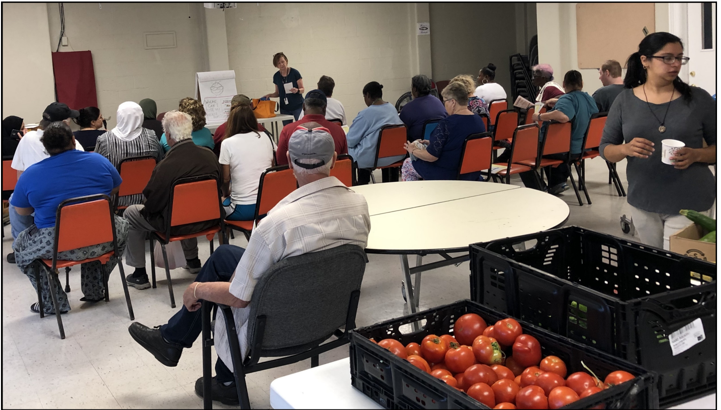
Pantry guests and others attend a Healthy Bucks workshop Sept. 6 during which they get information on eating and cooking healthy and then receive vouchers for fresh produce at the downtown farmers market.