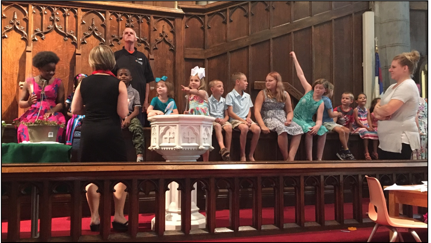
Children's Time during service of Aug. 4.