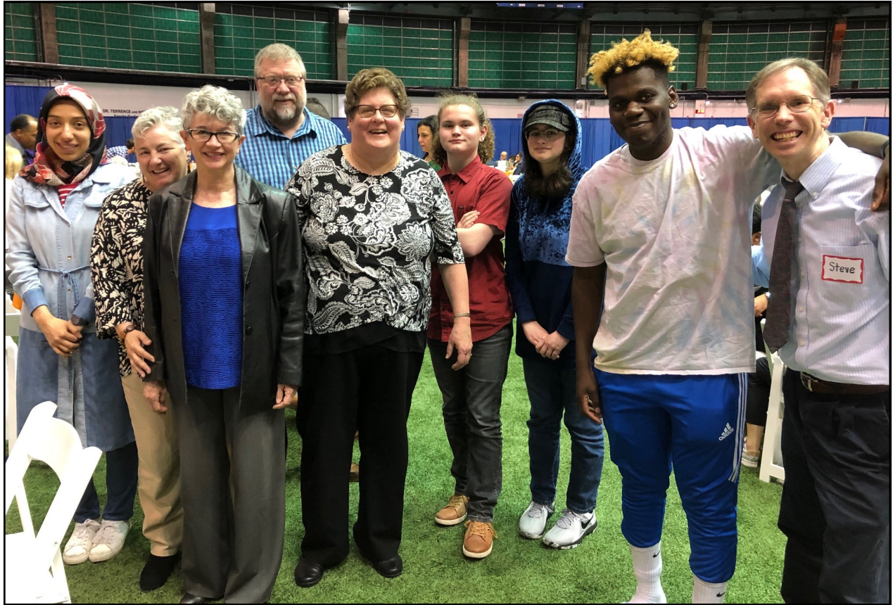
UUMC folks at the third annual Syracuse Ramadan iftar May 18 at Manley Field House. The iftar is the evening meal with which Muslims end their daily Ramadan fast at sunset.