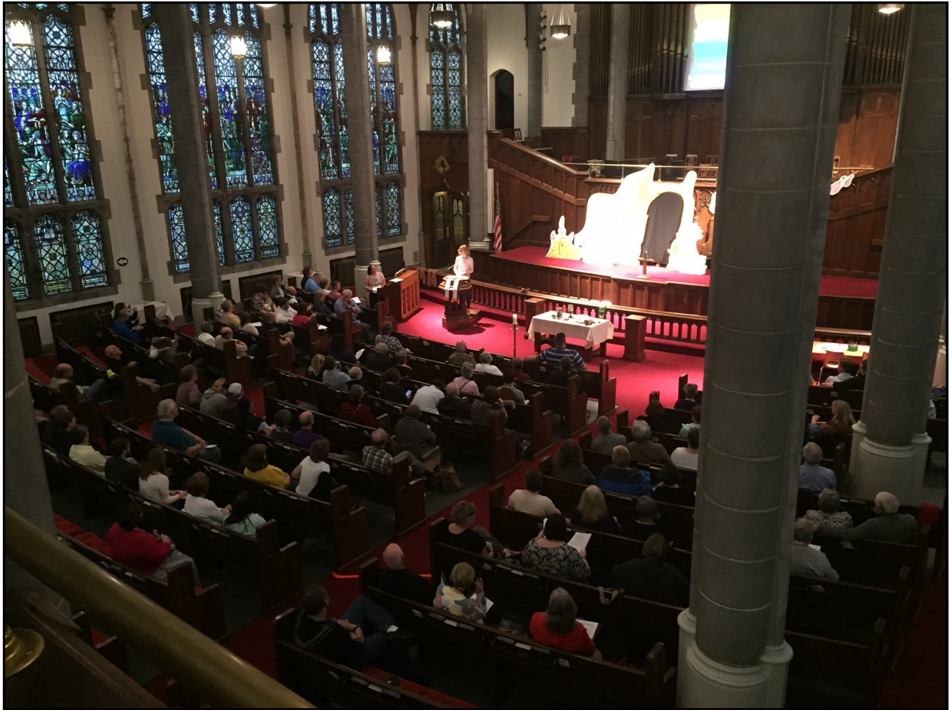
Upper New York for Full Inclusion worship/meeting at UUMC before Annual Conference.