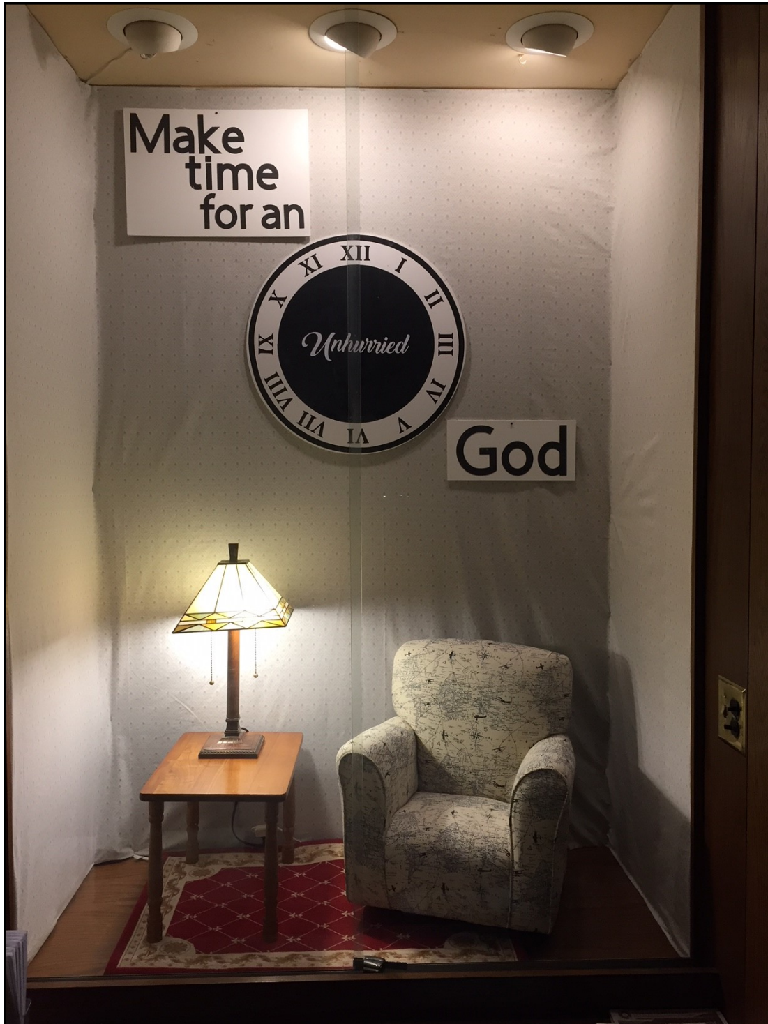
Peale Entrance window designed by Holly Austin for our current worship series: "Busy: Reconnecting with an Unhurried God"