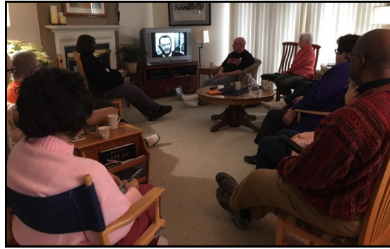
Spirit Film viewing of “With Infinite Hope.”

Eighteen people gathered Feb. 23 to view a new documentary about the civil rights movement in two cities — Birmingham and Memphis. The storyline of “With Infinite Hope” weaves through interviews with many of the “regular people” who worked behind the scenes in the movement.