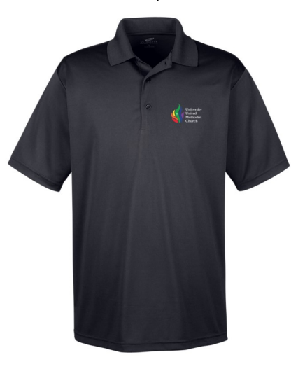
Men's Polo Shirt $28