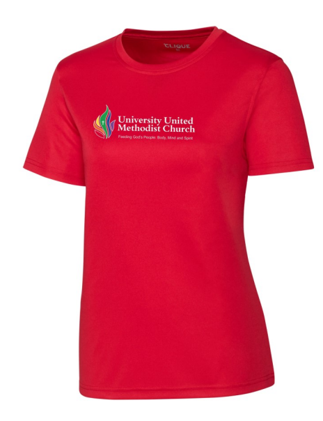
Women's T-shirt $15