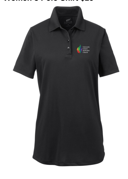
Women's Polo Shirt $28