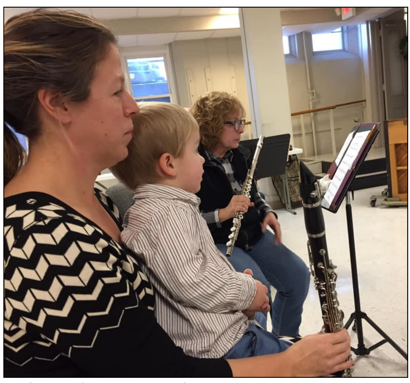
UUMC No-Fault Orchestra rehearses after worship.