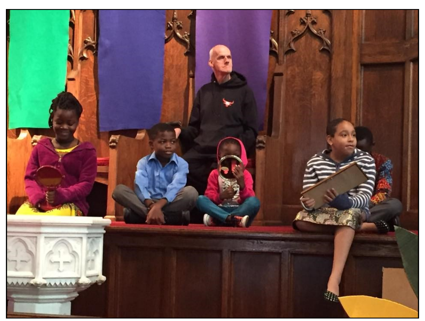
During Children's Time: Children learn they're created in God's image...so they have mirrors to look at themselves.