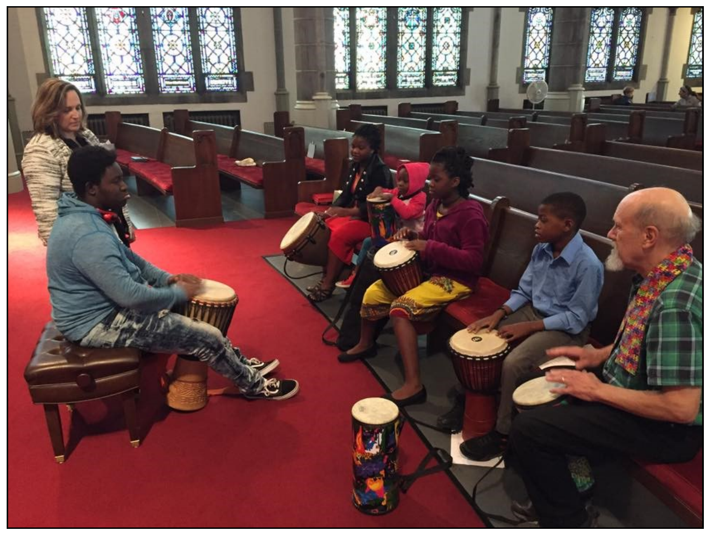
A drumming workshop after church.