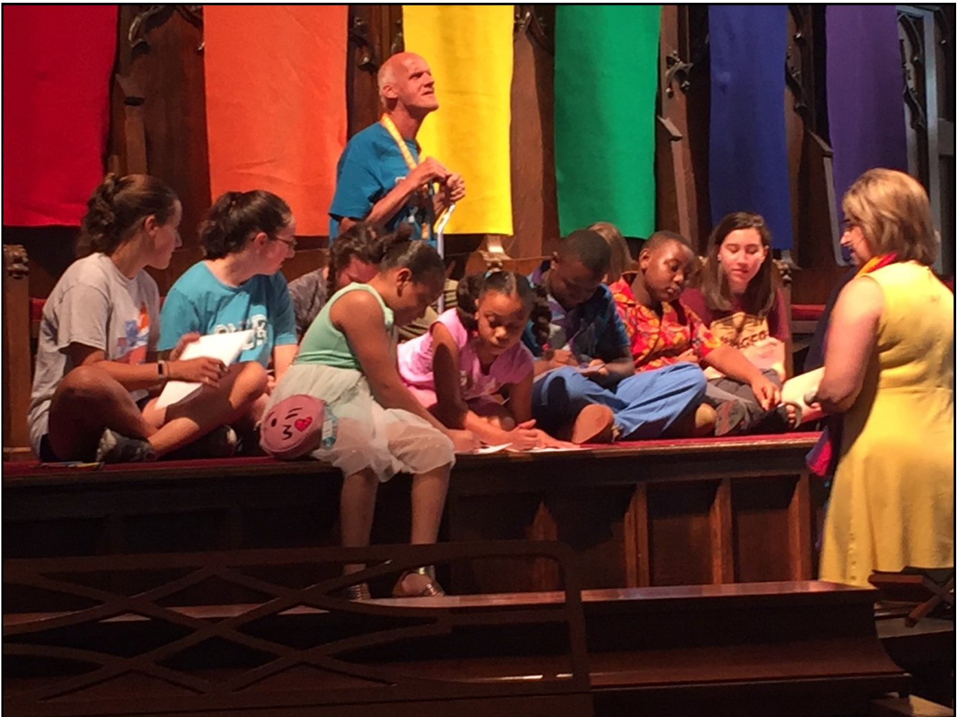
The children draw what they think the People of God look like.