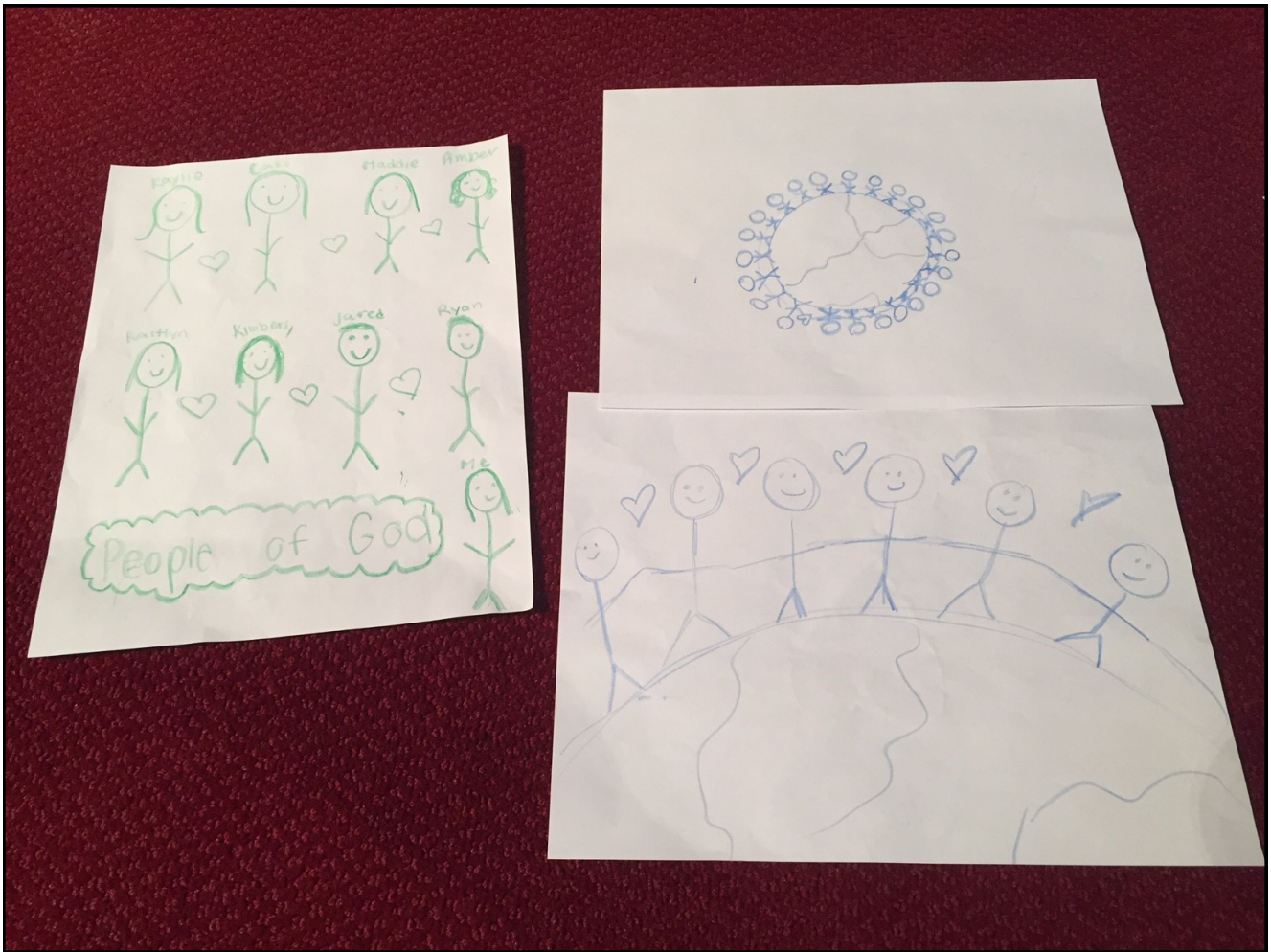
Some of the children's drawings.