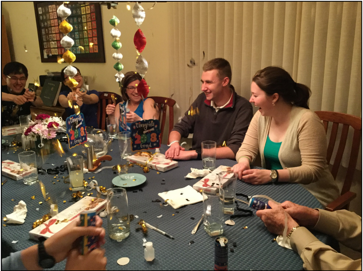
Poppers celebrate the graduates.