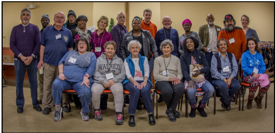
Our pantry volunteers will see new faces as UUMC absorbs part of the Grace Episcopal Church pantry's district.

been informed that the church has very limited funds to support the pantry into the future. Changes need to be made.