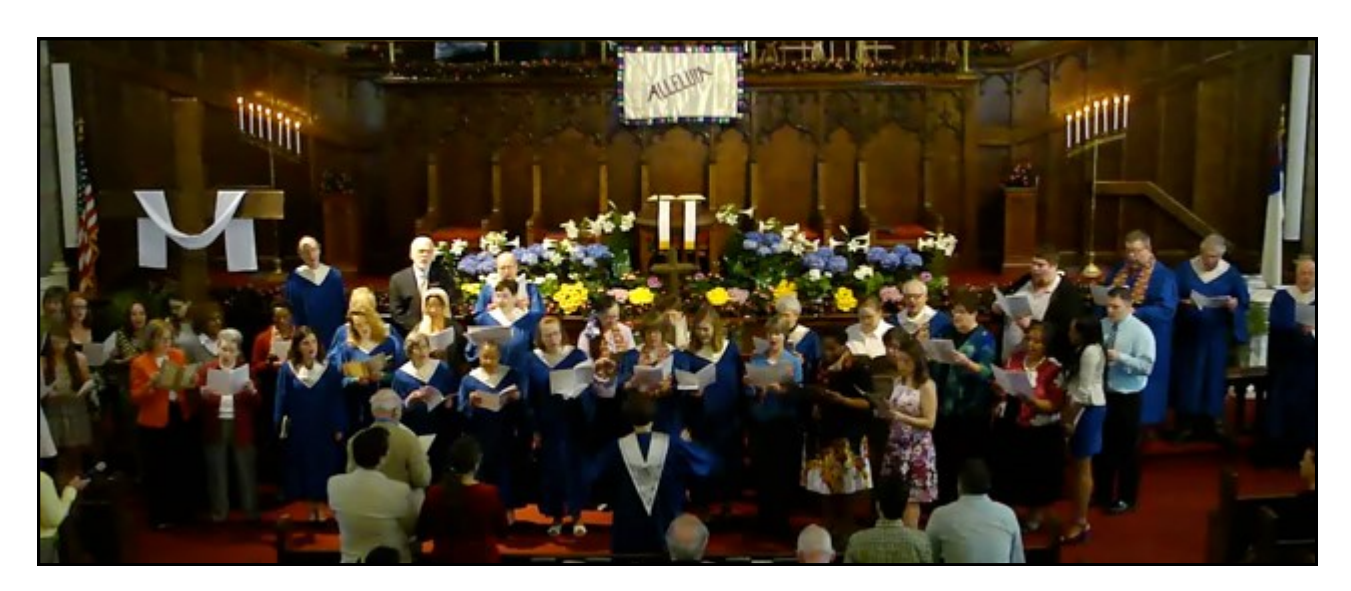
Senior Choir and those who came to join them from the congregation sing the "Hallelujah Chorus" at the end of the Easter service.